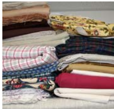
Correct material, color, and fiber content are essential to a good historical impression

working around fires and firearms. There is little documentation for wool aprons, however, wool will not support burning on its own and may be a wise choice for anyone working around the fire. (See burn test information at the end of the document.)