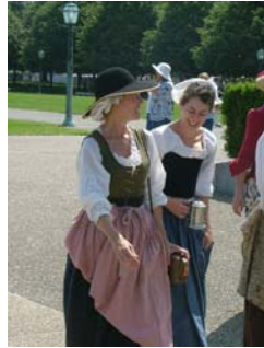
Stays and jumps

Stays and jumps are the 18 th century equivalent of a bra. They hold some characteristics in common with a corset. The purpose of the garment, however, was somewhat different. A corset was designed to change and alter a woman's appearance giving her a smaller waist and an hourglass shape. A stay, on the other hand, is a support garment providing support for the breasts as a bra does. It also provided back support as a woman's life was not easy and involved much hard labor.