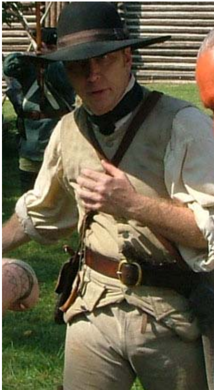
Short waistcoat typical of the Revolutionary War period. Also drop front breeches, white shirt, flat hat, neck cloth, and leather belt

Hats were worn by everyone. No man would leave the house without a head cover. The rather flat slouch hat was worn