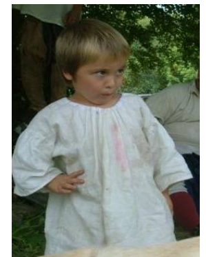
A shift and dress were worn by both boys and girls.

Infants often were placed in linen shirts then wrapped (swaddled) using a long narrow piece of cloth. This bound the arms and legs, thus restricting the infant's movement. Today, swaddling is not recommended for health reasons. A simple shift and flannel or wool blankets are acceptable. Toddlers, both boys and