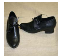
Shoes tied with ribbon

Footwear includes leather shoes either with ties or with buckles. Fabric shoes of similar design were common among ladies. Most women's shoes had a somewhat pointed toe and a low heel one- to one-and-a-half-inches. Ties may be of cord, leather, or ribbon. Center-seam or pucker-toed moccasins also would be correct for frontier women. Wooden shoes were common in