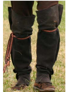
Wool leggings with woven garters

Leggings were commonly worn by men of all classes. Leggings were used to protect the lower leg and stocking when working or hunting. Leggings for this period were just above knee-length, occasionally being four or five inches above the knee.