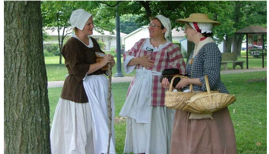
Women in cloth caps, short gowns, and petticoats. Aprons should be worn by most women. Straw hats were common, but would be worn over a cloth cap

Trousers (long pants) are OK, but were typically a sign of the lower class. Trousers may have been more common among the French. Similar to breeches, trousers should be drop front style.