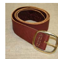
Double-D buckle and belt

Most leggings are wool and constructed as a simple tube pulled on over the foot. Most leggings of this period utilize a seam on the outside with a flap of up to four inches from the seam.