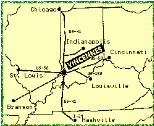
Special Program credits